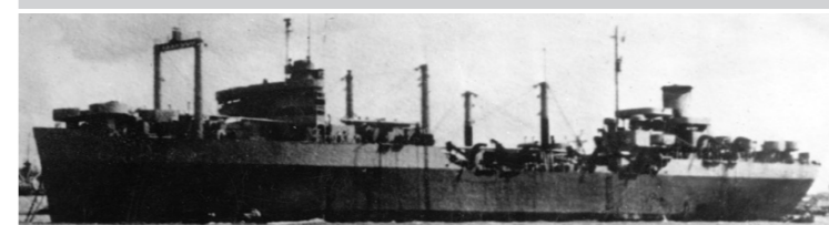
SS Marine Devil: 12,500 tons, 530 feet long, 2500 troops, 9000 horse power steam turbine engine

The official caption on the photo was "troop transport SS Marine Devil."