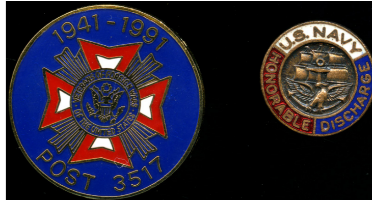
Left: 50th Anniversary pin of Manning VFW Post 3517 Right: Chuck's US Navy Honorable Discharge pin