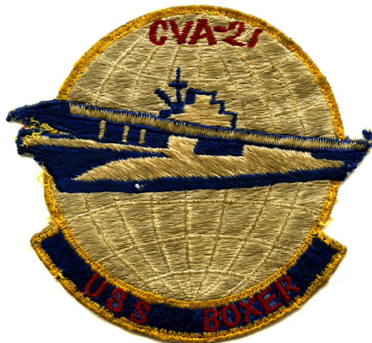
Official patch of the USS Boxer CVA-21