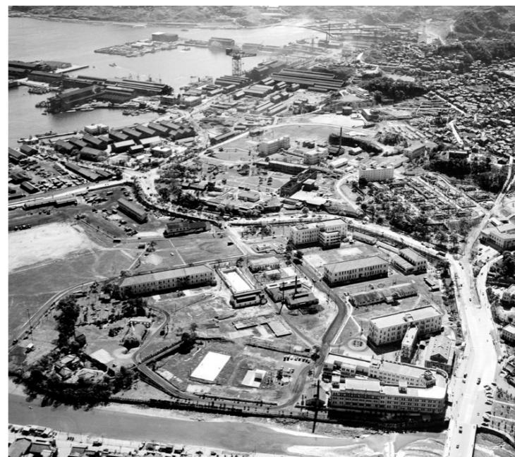
Possibly the US base in Japan