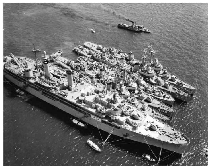
Ships docked in the harbor