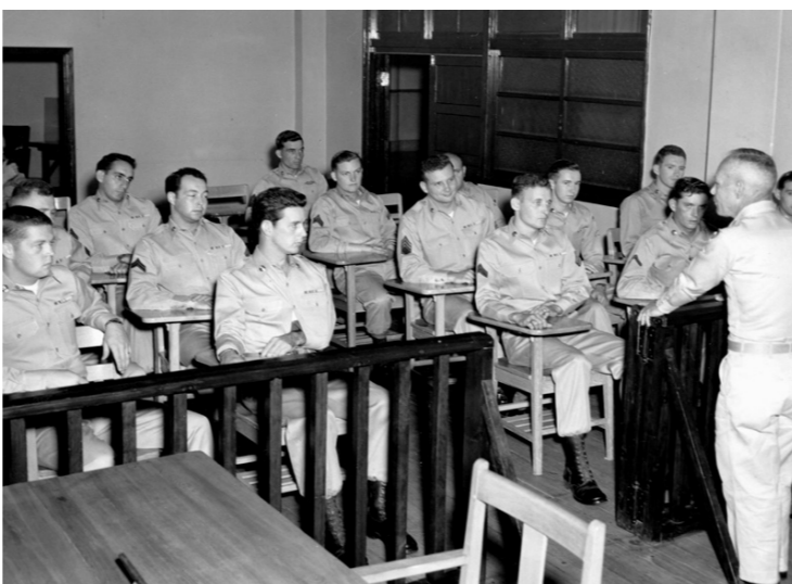
Classroom instruction in Japan