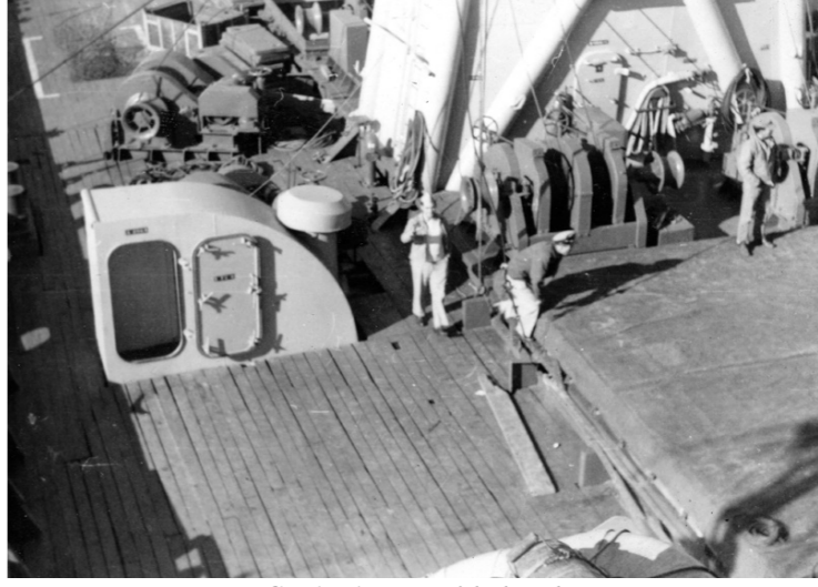
CHARA - port side hatch

The rest of the pictures were scanned in order from page 1 through the last page. I assume they would be fairly chronological so that is the order in which I'll show them. It gives a rough time-line and locations that Casey was serving at.