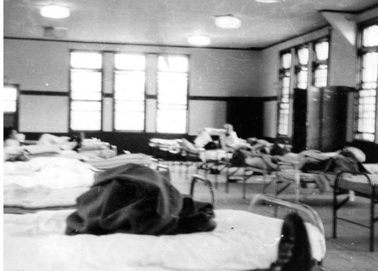
Camp Wood dormitory U.S. military base, near Kumamoto, Japan