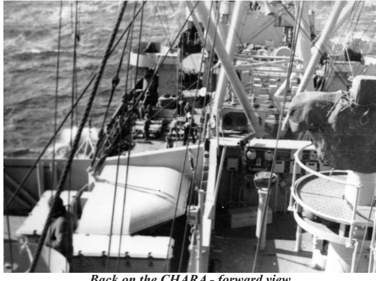
Back on the CHARA - forward view