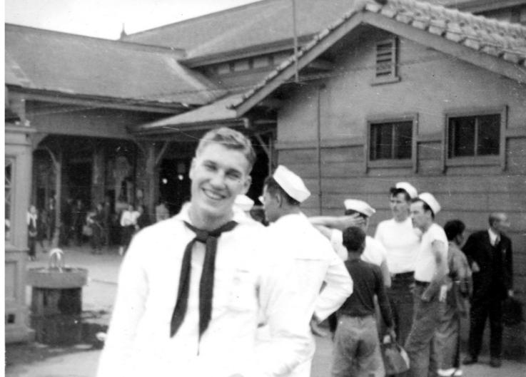
Fulfer ME3 - R&R while stationed at Camp Wood