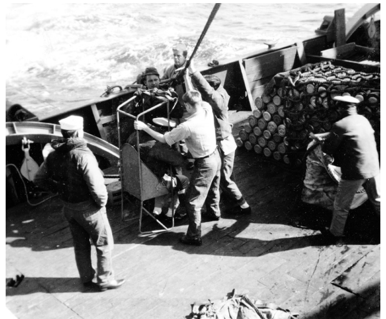
Transferring a man from the CHARA to the PLATTE