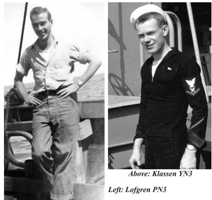
Above: Klassen YN3