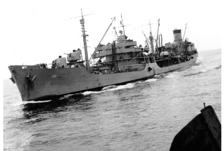
USS Platte AO-24