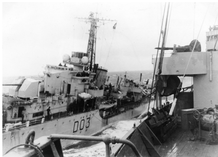
CHARA resupplying the HMS Concord D-03

Latest Naval Action TOKYO, November 1, 1951 (Thursday) - Text of a Far East naval summary of yesterday's operations: The United Nations blockade and escort force warships and aircraft continued to pound Communist military targets along both east and west coasts of Korea yesterday with sea and aerial bombardments.