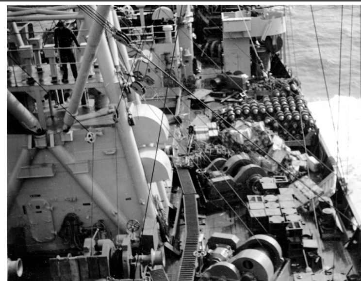
CHARA deck loaded before rearming another ship