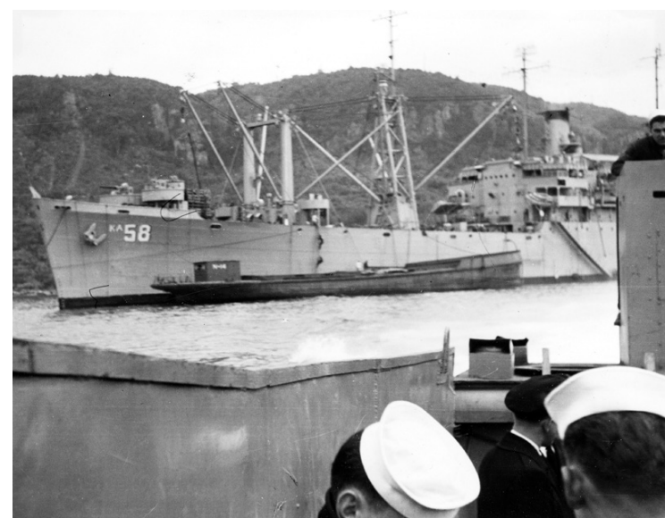
CHARA back in Sasebo, Japan