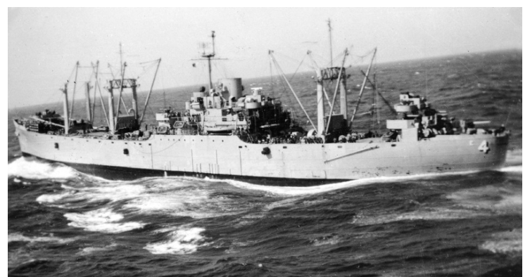
USS Mount Baker AE-4