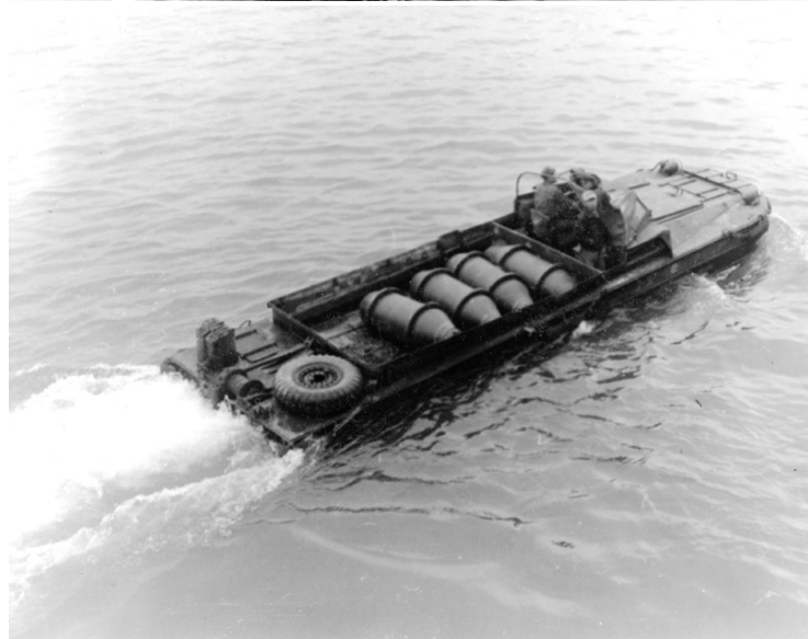
Off loading 1000 pound bombs near Pohang, Korea