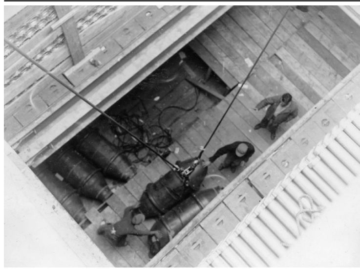
Off loading 1000 pound bombs, near Pohang, Korea