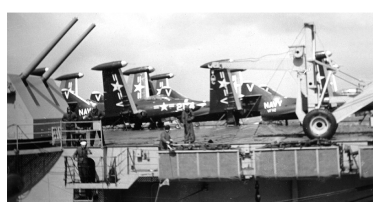
Flight deck of a carrier next to the CHARA