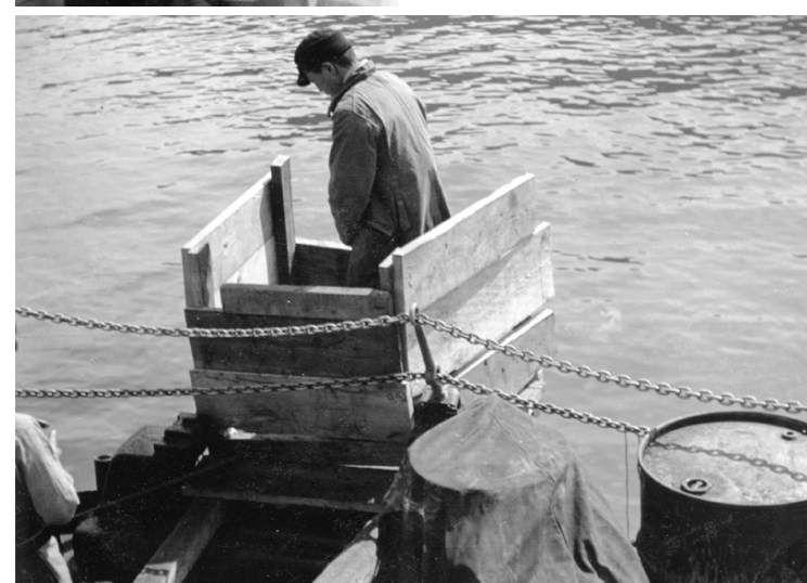
Binjo - outhouse on a small Korean transport boat