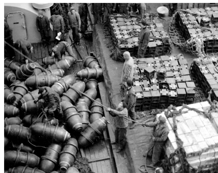
CHARA deck loaded before rearming