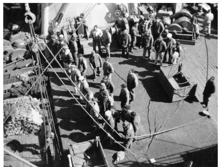
CHARA supplying the USS Platte AO-24