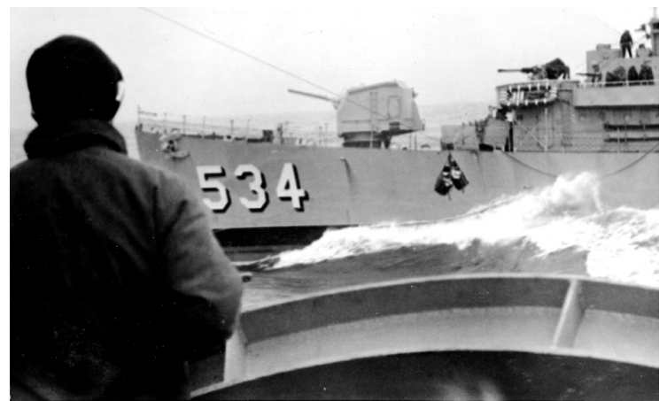
USS Silverstein (DE-534)

Other Task Force 95 units maintained blockade and bombardment patrols off Wonsan, Hungnam, Songjin and Chongjin.