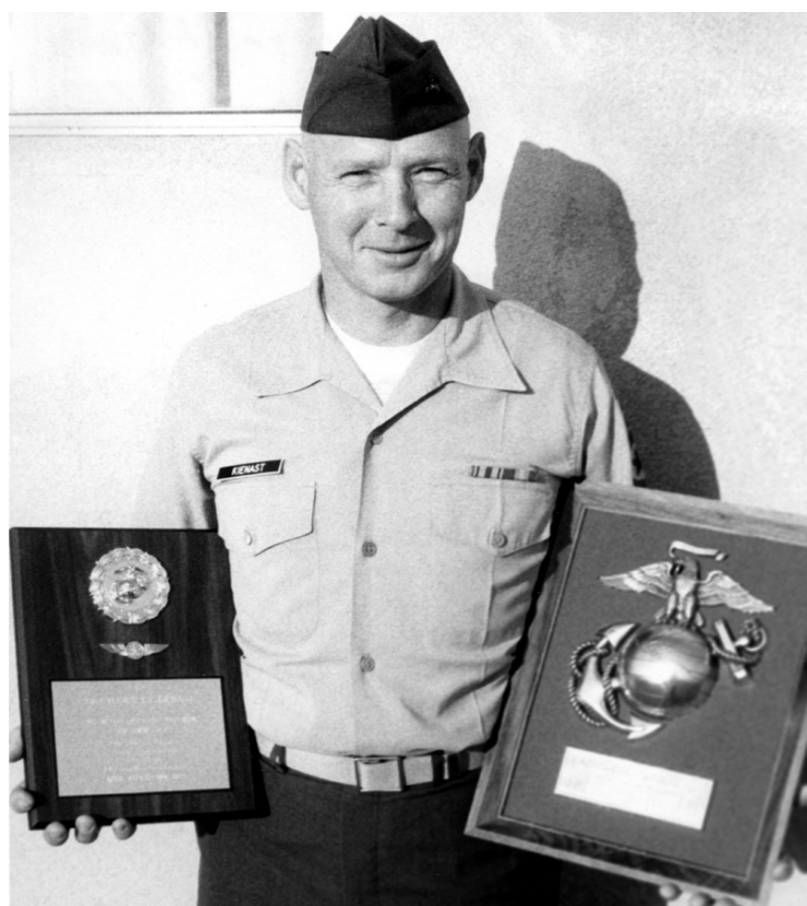
1982 Retirement - leaving HMM-764 Mag-46 Plaque from staff, enlisted men, and officers.