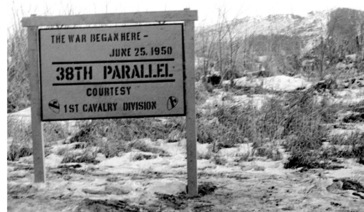
38th Parallel - June 25, 1950 when the war began for the US