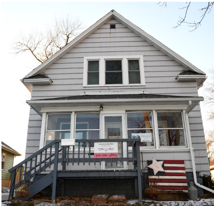
Love is in the Hair, 111 Ann Street

Our first new business featured is Love is in the Hair .