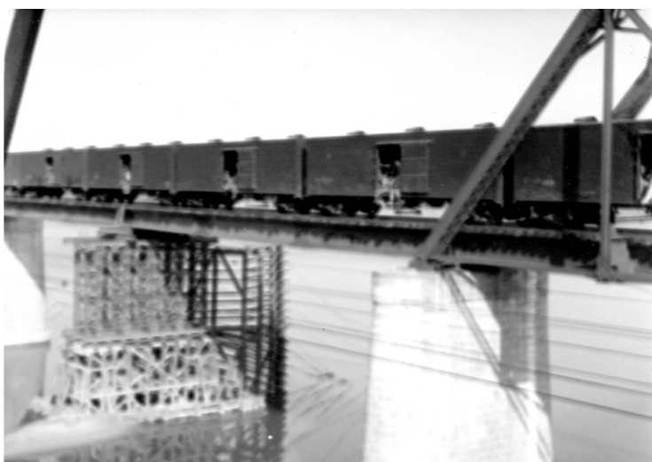
"Train load of South Koreans - what a way to travel, and let me tell you those cars stink." September 1953 Probably South Korean refugees returning to Seoul and the surrounding area after the war.

The US soldiers had to protect these trains from sabotage to prevent the South Koreans from killing the prisoners from the north during their return trip home on the troop trains.