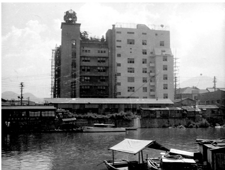
This building was one of the largest buildings still standing in Seoul at that time. Most of the buildings were flattened from the war going back and forth four times through Seoul.