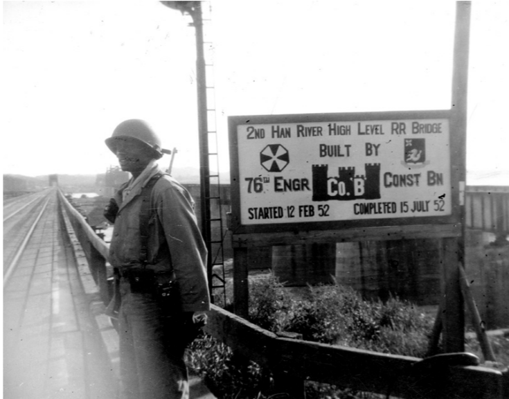
"Digger, a fellow guard on our bridge, it's about a mile long with the actual river further over on the other end."