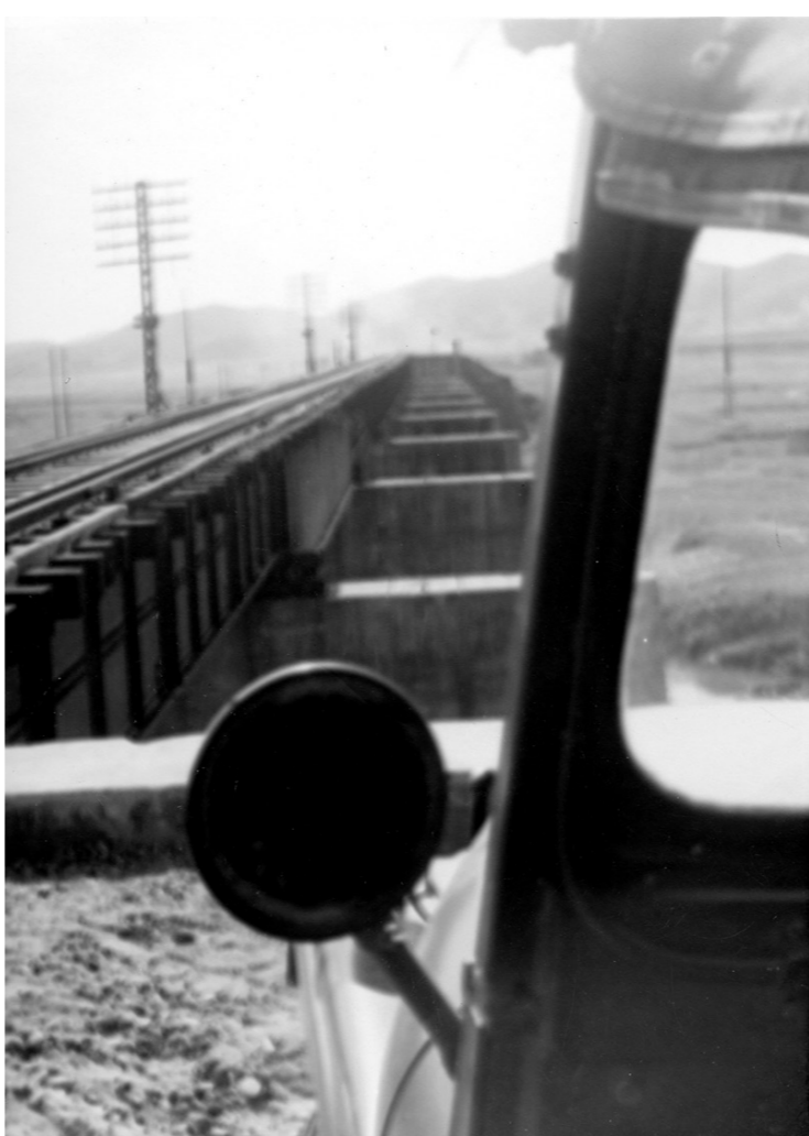
"Post No. 10, another bridge we guarded in Seoul." There were smaller streams in Seoul that bridges crossed over too.