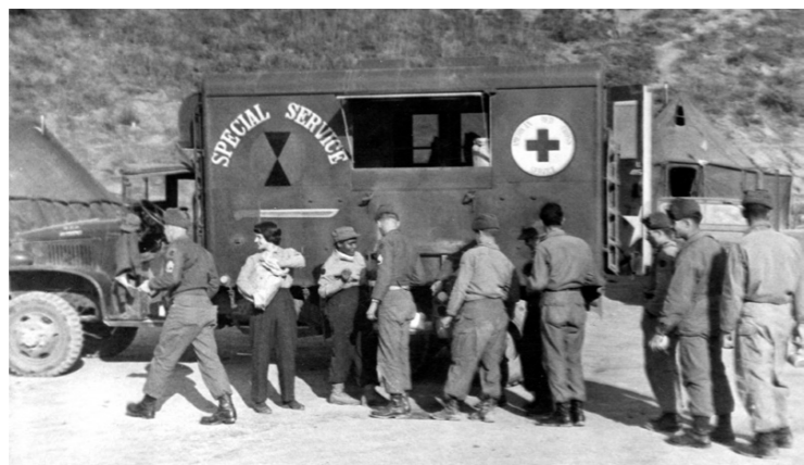
After the war "The gals from the Red Cross with their coffee and doughnuts. The First Sergeant is in front." For some reason the Red Cross was charging 50 cents per doughnut. They had borrowed the 7th Division truck. The hour glass on the side of the truck is the insignia for the 7th Division.