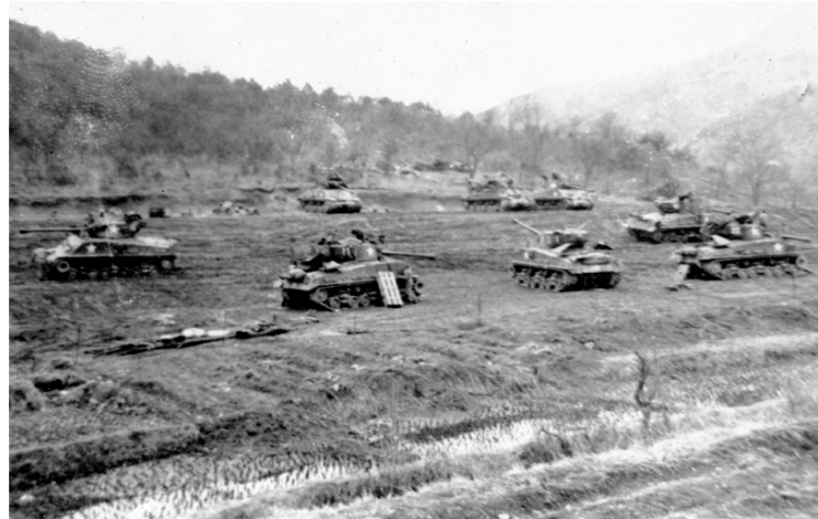
17th tank company after the war