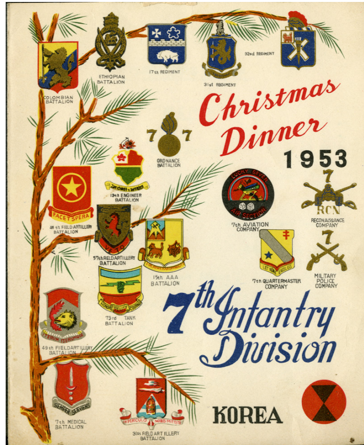
Thanksgiving and Christmas dinner programs 1953