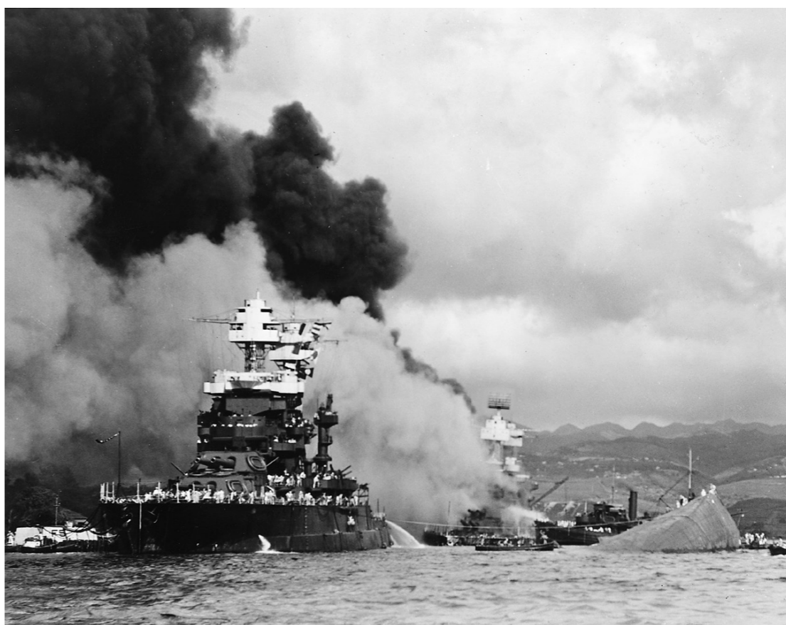
The Maryland on the left, with the capsized Oklahoma on the right, while the West Virginia burns in the background.

The Jap bombs were 14 inch armor-piercing shells made into bombs, designed to penetrate the deck and then explode inside the hull. This is what was so devastating for the Arizona because of secondary explosions by the tons of munitions on board that blew up too.