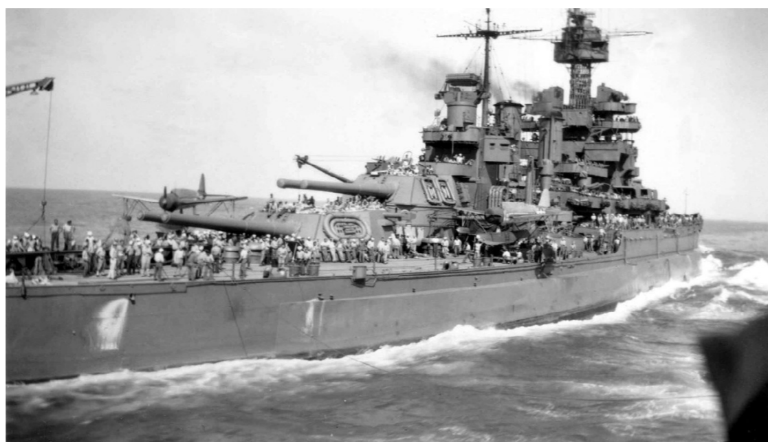
The whole fleet left Long Beach, California, and moved to Pearl Harbor in July of 1940. On their way across the Pacific Ocean they crossed the equator, and then traveled back north to Pearl Harbor.

"Remember, there's 35 feet of ship under the water and 100 feet above the water line" so there was a lot of surface to clean and paint.