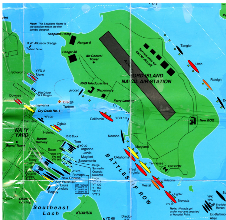
Map of Battleship Row

The Oklahoma, Arizona, and Nevada had just come back in Friday night from maneuvers - before the attack on Sunday.