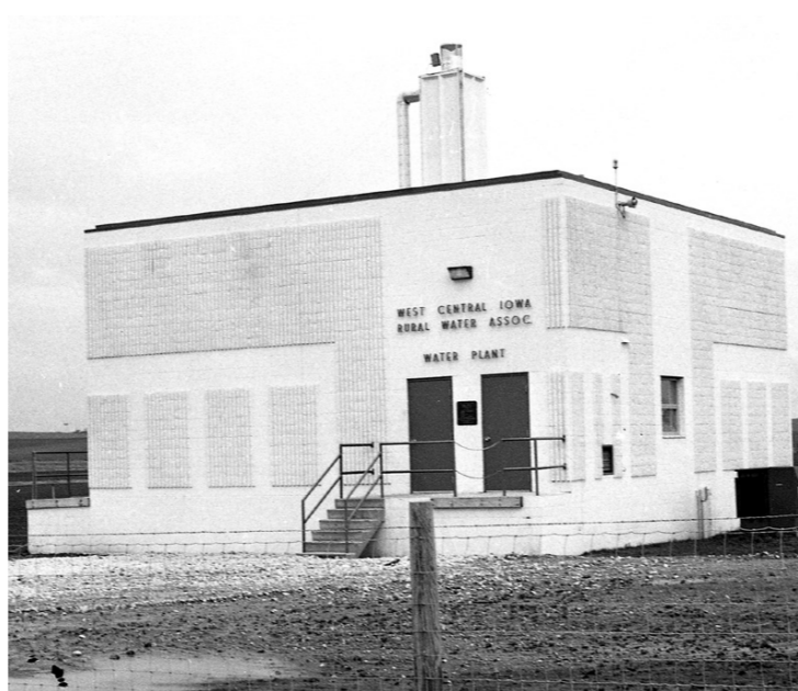
1975 new rural water plant just southwest of Manning

Bridget commented how it is "neat to have someone in the family connected with Rural Water again."