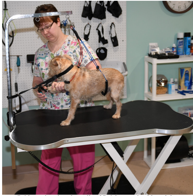
Bridget trimming the nails of Paisley, a mixed breed dog.

An electric lift table that costs around $600 was purchased, which is very important to have when working with large dogs up to 120 pounds.