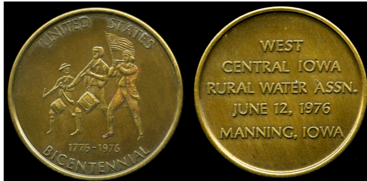
1976 bicentennial commemorative Rural Water coin