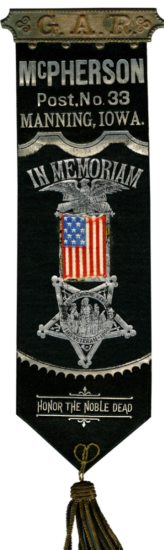
Original ribbon on the left with digitally repaired ribbon on right.

I always like to find corroborating information for historical facts. This is another reason why when people don't get their old pictures and information to me, while their family may preserve it for several more generations, they are doing a disservice to themselves and their family history. While they have their family history they won't have all of the other types of information I have that will either corroborate their facts or maybe prove that they have some erroneous information.